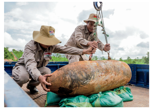
PeaceTrees Explosive Ordnance Disposal technicians safely removing a large bomb from a rubber plantation- Oct. 2022