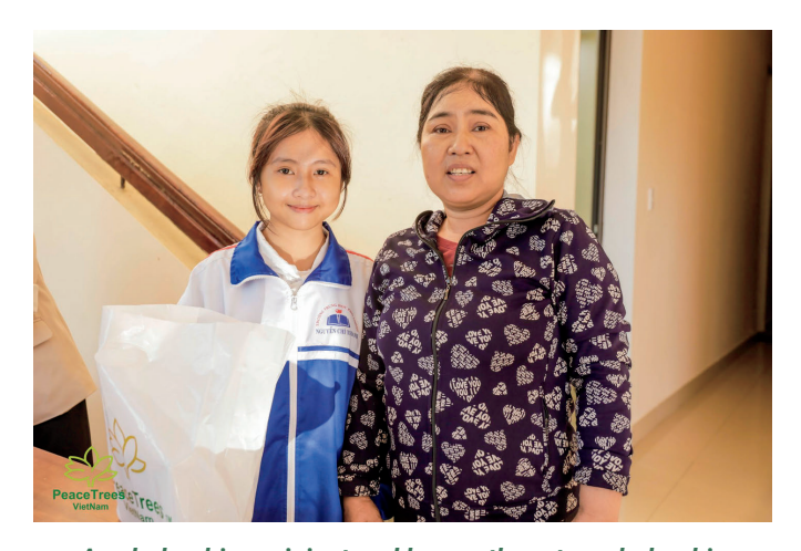
A scholarship recipient and her mother at a scholarship award ceremony in 2022

intersection of land and people, PeaceTrees aims to provide meaningful support to communities facing climate change related challenges so they can thrive now and into the future.