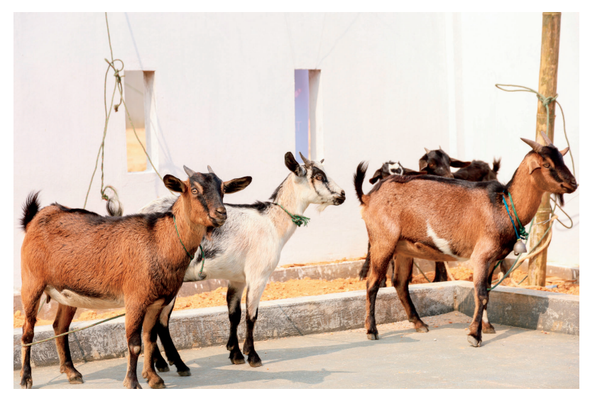
Goats being delivered to flood impacted families of Lia, Xy, and Huong Son Communes in Quang Tri Province.

PeaceTrees committed to is supporting communities throughout central Vietnam as they begin to address challenges caused and exacerbated by climate change. Over the last PeaceTrees continued building has support the families most programs to impacted by the devastating storms and floods of 2020. In addition to the dwarf banana project in Ta Lao Village, PeaceTrees provided a water well in Cu Ty Village, started a goat husbandry program in Huong Hoa District, and helped move families into new homes through the Huong Viet Commune Resettlement Project. Working at the