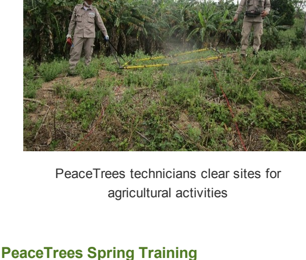
With our more recent expansion to Quang Binh Province, PeaceTrees EOD technicians have been

to cultivate crops this season. Our teams located and safely removed 26 explosive remnants of war and cleared over 153,000 square meters of land meant for growing cassava, bananas, coffee, and other important crops. Safely clearing land for farming is an important part of our work and helps communities secure economic opportunities for themselves and their families!