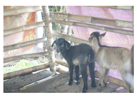
Baby goats at Xy commune - Quảng Trị Province