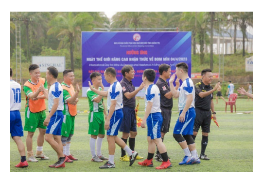
The PeaceTrees soccer team shaking hands with opponents after the friendly match-Quảng Tri Province