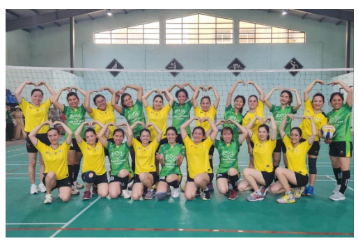
PeaceTrees deminers and program staff posing after a volleyball game- Quảng Tri Province