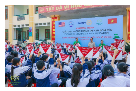
Students of Thuan Duc primary and secondary school learning what to do if they encounter an EO- Quảng Bình Province