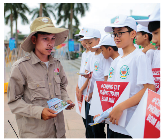
Mine Risk Education Camp being conducted in Quang Tri province - October 20, 2019

A future where children can be safe from the explosive remnants of war is finally within reach in central Vietnam. As we enter our 25th year of work, we plan to continue increasing our productivity through additional expansion of our demining teams which will allow us to make this safe future a reality!