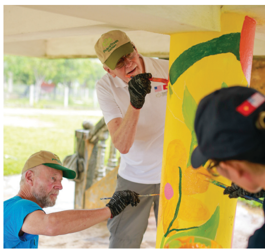
September Citisen Diplomats painting the Ba Long Community Center, September 2019