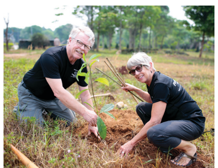
Citizen diplomats planting avocado trees -Marhc 2019