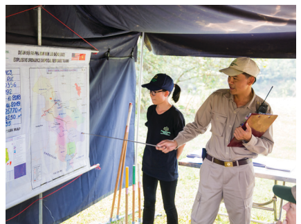
EOD safety breifing for visitors - Marhc 2019

In 2020, we plan to continue expansion, redoubling our efforts to make Quảng Trị UXO impact-free by 2025 and establishing work in other UXO-impacted areas of central Vietnam. We will prioritize economic stability within ethnic minority communities most affected by the legacy of war, and continue to invest in educational opportunities for those who need it most.