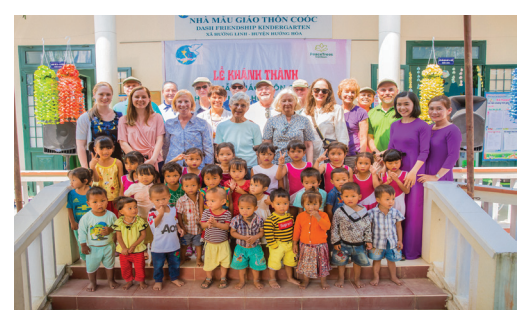
Dash Friendship Kindergarten built 2018, dedicated March 2019