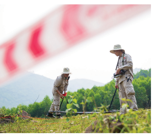
EOD Technicians surveying the land for UXO - March 2019