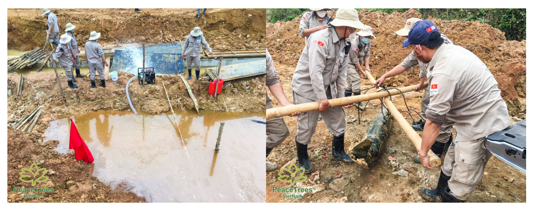
A PeaceTrees EOD team pumping water out of the channel to access the bomb, Dong Hoi City, Quảng Bình Province

On March 1, construction workers in Dong Hoi City, Quảng Bình Province discovered a large bomb while working alongside the Hồ Chí Minh Highway. After PeaceTrees received word, EOD teams were deployed to the site. It took two hours for the team to pump water out of the channel to safely access the bomb. After evaluating that the bomb was safe to remove, it was carefully hoisted up using bamboo poles and was identified as a 500 lb. MK-82 bomb. This is the seventh large aircraft bomb that PeaceTrees' Quảng Bình teams have been called to respond to since the start of the year! Learn more about our work in Quảng Bình Province here!