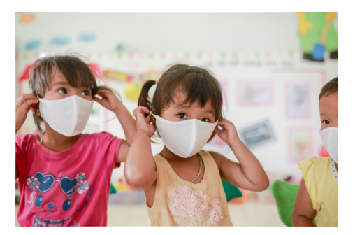
Children at the Jesse Griego Kindergarten, May 2020