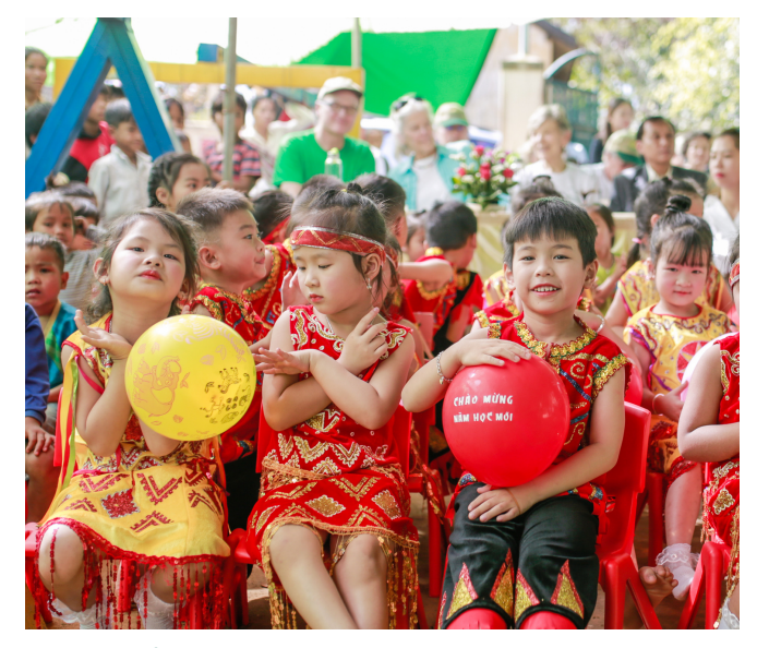
Cheerful Children Kindergarten dedication, January 2020

October 2020 brought multiple disasters to communities across 11 provinces in central Vietnam where torrential rains and severe landslides impacted over one million people. Thanks to the incredible support of our community, our teams assembled and delivered aid packets for nearly 1,000 families containing 5kg of rice, instant noodles, fish sauce, salt, dry wares and canned food. Our EOD teams quickly returned to the field to focus on safely removing and destroying ordnance exposed by the recent flooding and landslides. The teams responded to callouts for 7 large bombs (500 lbs.) and countless other unexploded cluster munitions, mortars, shells, and mines. We are committed to providing sustained support for communities as they continue to recover from these disasters.