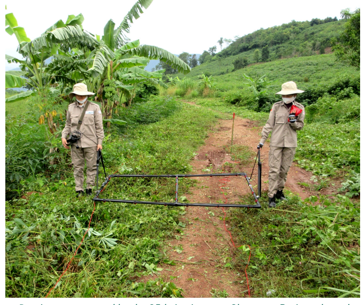
Deminers sponsored by the 25th Anniversary Clearance Project cleared 10,560 m2 in October 2020 to allow for the construction of roads to cultivated areas in A Doi commune, Huong Hoa District

We continued to emphasize Explosive Risk Ordnance Education (EORE). In 2020 alone 19,782 people received EORE. Due to COVID-19 this year, PeaceTrees facilitated a virtual EORE artwork competition for four schools in Hương Hóa and Đa Krông Districts to promote knowledge on how to stay safe. 1,369 students participated in a two-week competition that involved mural paintings, poster making, and the creation of educational videos on the risks of UXO. PeaceTrees' EORE activities have become one of the most interesting and meaningful extra-curricular activities offered to students in these districts.