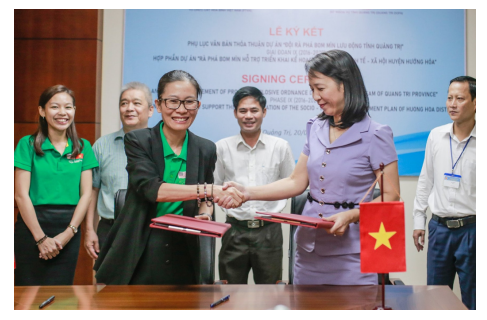
Signing of the 25th anniversary clearance project memorandum, July 20, 2020

October brought devastating and torrential rains to central Vietnam, resulting in flooding and landslides that impacted over one million people. PeaceTrees Explosive Ordnance Disposal (EOD) teams, experienced in providing emergency support in rural and difficult-to-reach areas, provided emergency aid during and immediately after the crisis. In addition to providing the safe clearance of unexploded ordnance exposed by the flood, PeaceTrees has worked to repair and rebuild schools and libraries damaged in the storms as well as to provide aid to impacted families.