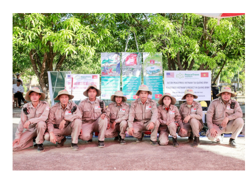
Quảng Bình demining team, December 22, 2020

Expansion to Quảng Bình: We are also proud to have formally established a partnership with Quảng Bình Province this year. Quảng Bình neighbors Quảng Trị to the north and remains heavily affected by the presence of explosive remnants of war. In partnership with Mines Advisory Group and Norwegian People's Aid, PeaceTrees EOD Technicians now work every day to reduce the risk of UXO in Quảng Bình. As part of our holistic development model, we have also expanded post-clearance support in the province, including scholarship, kindergarten, and explosive ordnance risk education programs. As part of this initiative, a new kindergarten in Ooc Village, sponsored by citizen diplomacy alumni who traveled to Vietnam in March 2019, will open this fall.