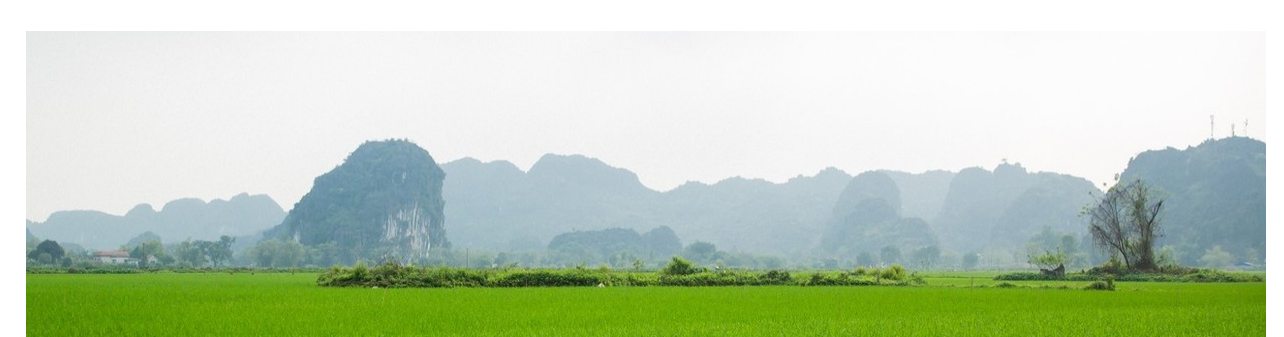
Celebrating 25 Years of Partnership and Friendship in Vietnam