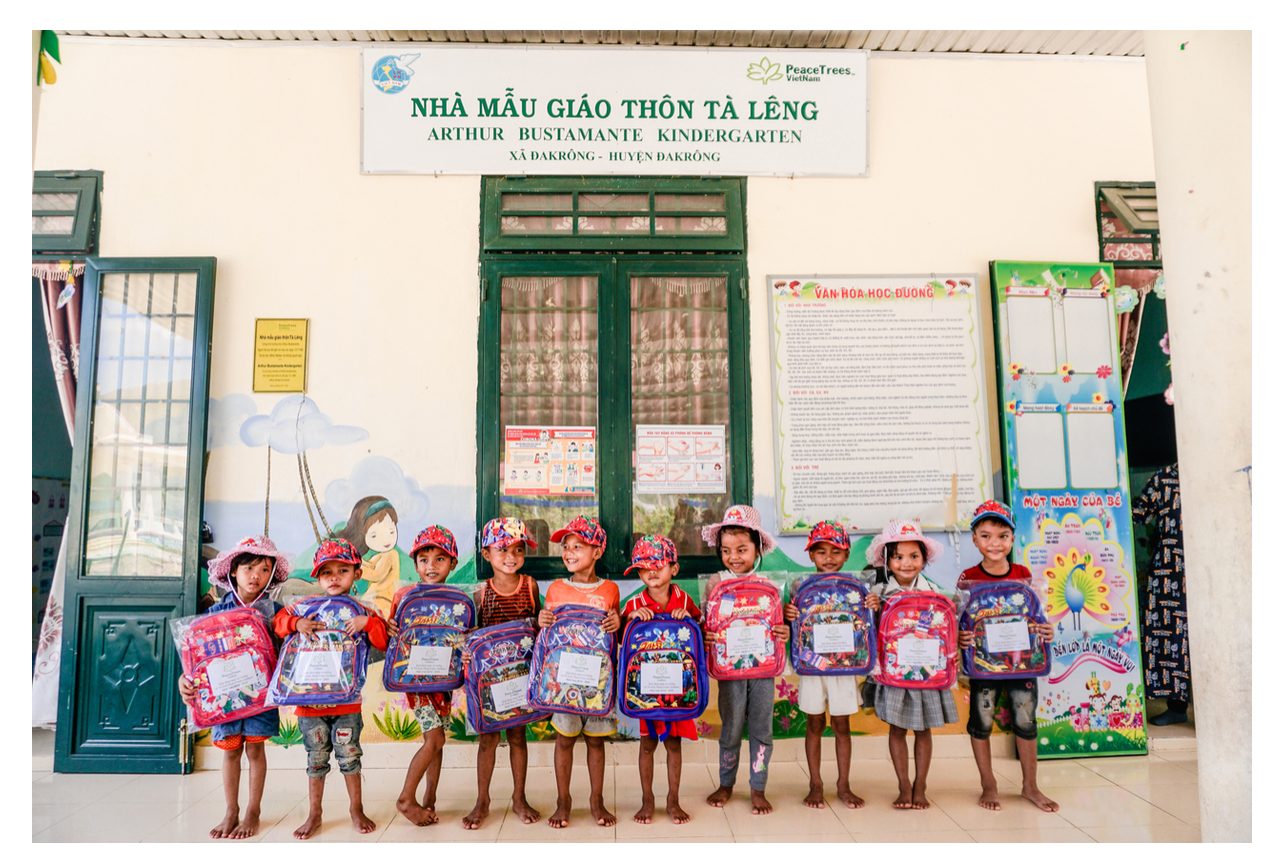
The 2020 graduating class at the Arthur Bustamante Kindergarten in Ta Leng Village, Da Krong District, Quang Tri Province

We are thrilled to present to you the graduating class of 2020! This month, 189 young scholars graduated from PeaceTrees' 16 kindergartens. To celebrate, PeaceTrees Vietnam gifted each child a new backpack to use when they enter first grade this fall. Join us in applauding these bright students and their latest achievements! <u>You can read more about PTVN's kindergartens and how we work to meet the needs of children who benefit the most from early education opportunities here.</u>