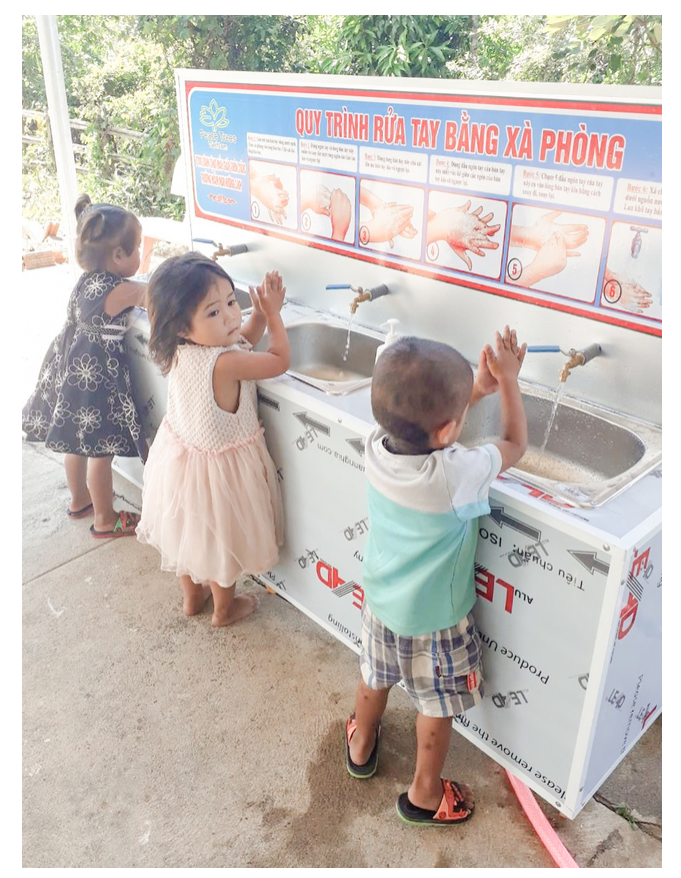
Kindergarteners at Dash Friendship Village in Cooc Village using the portable washing stations - May 2020