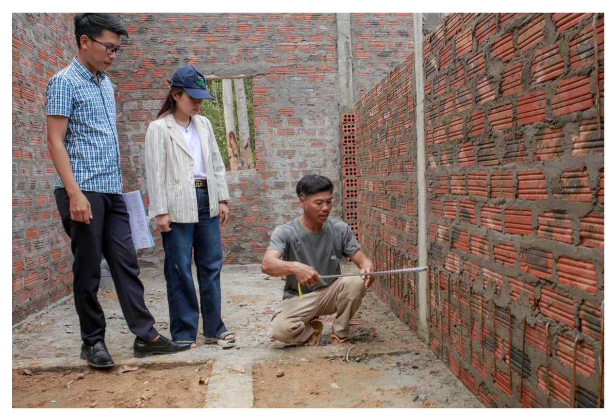
Prin Thanh Kindergarten construction in progress - May 2020

Prin Thahn Kindergarten - Construction Progress