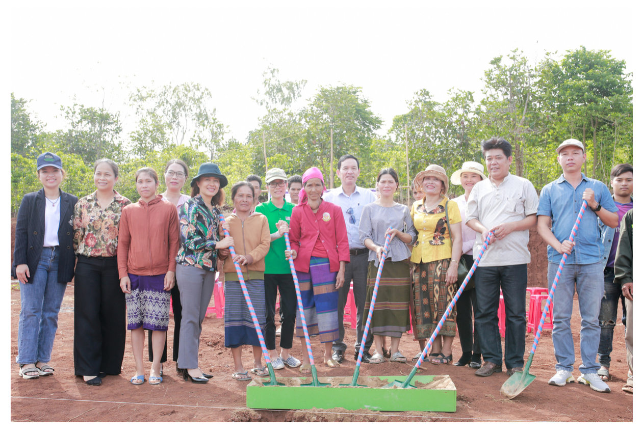
Ground breaking ceremony for the kindergarten with Cua Village community members, local authorities, the Quảng Trị Women's Union and PeaceTrees staff - May 2020

The Women's Union of Quảng Trị Province, and PeaceTrees Vietnam, have jointly developed a proposal for a two-room kindergarten to be built in Cua Village of Quảng Trị Province. Cua village is comprised of 101 households, 71% of whom identify as ethnic minority. Nearly half of households are officially classified as poor by the government. Cua Village is located in Huong Tan, a disadvantaged commune within Hương Hóa district. The economy is predominantly agricultural (mostly subsistence farming) and the infrastructure system is weak.