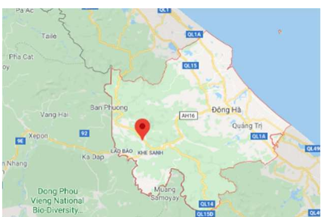
Cua Village is in Huong Tan Commune, Hương Hóa District, Quảng Trị Province

Prin Thahn Kindergarten - Construction Progress