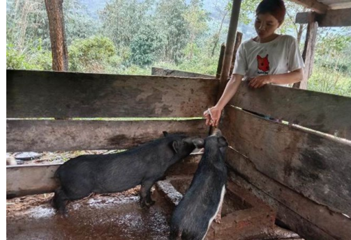
A new pig farmer gets acquainted with the livestock in Đakrông District