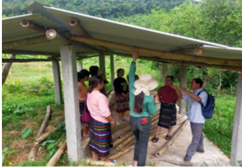
Community members are guided in pig husbandry and housing in Đakrông District

by a comprehensive training course on pig-raising for all participants, followed by 20 pig breeds being distributed, 2 per household. Households constructed well-designed pigsties using local materials and utilizing post-harvest banana stems as feed. The active involvement of commune women officers, who regularly monitor and collaborate with local veterinary officers, ensures timely guidance on vaccinations and maintenance. The Pig Breeding Project is not just about pigs; it's a testament to community collaboration and sustainable farming practices.