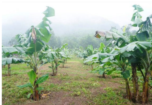
Thriving banana plants in Hướng Hóa District