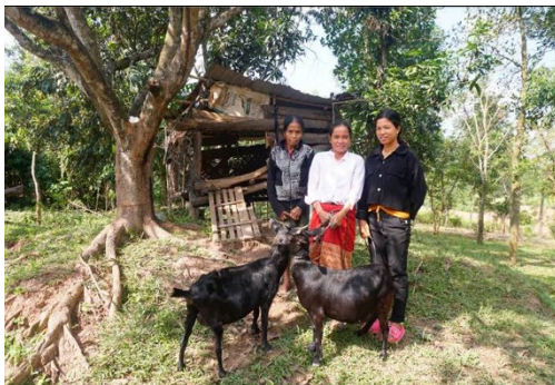
Goat farmers with their livestock in Đakrông District

At Ta Lao village in Đakrông District, the Indigenous Banana Planting Project is yielding results, boasting a flourishing orchard of 2,700 banana trees. Celebrating the harvest season, households have produced 285 bunches of bananas, and three households have ventured into sales, adding 12,500,000 VND ($508 USD) to their income. Despite some challenges in farming, the community remains committed to sustainable banana farming.