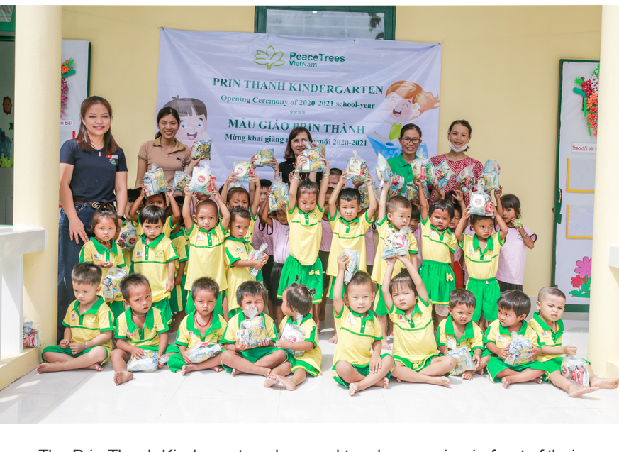
The Prin Thanh Kindergarten class and teachers posing in front of their completed school on September 8th, 2020 in Quang Tri.

We are excited to announce that the construction of the Prin Thanh Kindergarten in Quang Tri Province has been completed in time for the 2020-2021 school year! On the first day of school, September 8th, teachers welcomed 30 students, ages 3-4, to the new classroom. Our team visited the new students and gifted them care packages for the new year including milk, snacks, toys and foam carpets for the children to sit on. Thanks to the support of a matching grant that we received through One Day's Wages and the dedication and generosity of the Hayward family and many other donors, children will have a safe place to learn and play in Prin Thanh Village for years to come.