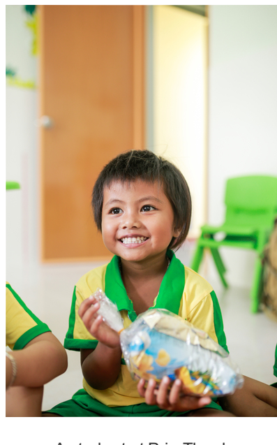
A student at Prin Thanh Kindergarten excitedly receives their gift on the first day of school.