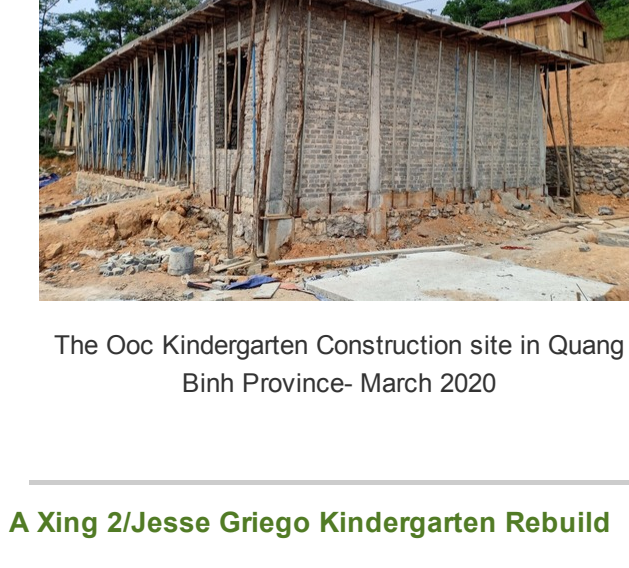
In our November newsletter, we shared that the A Xing 2 Kindergarten, named after Jesse Griego, needed to be completely rebuilt after the horrific October flooding in central Vietnam. We are excited to share that the funding for this rebuild is complete! This amazing effort was led by the school's

The Ooc Kindergarten has hit an exciting milestone in its construction, the school building is now 50%