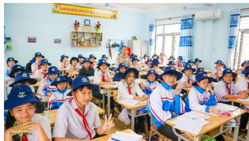
Students attend an EORE event in Quảng Bình province