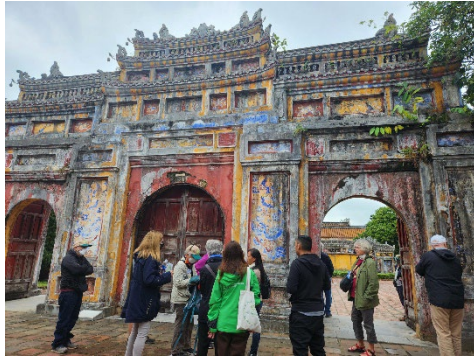
Citizen Diplomats visiting the Hue City Citadel, a historic royal palace set within the walled forbidden city

A Citizen Diplomat reads to students at Prin Thanh Kindergarten in QuảngTrị Province