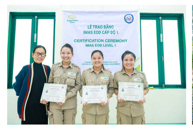
Three of the EOD technicians receiving their IMAS Level 1 Certificates on November 5th

On November 5th, 41 more members of PeaceTrees Explosive Ordnance Disposal teams received International Mine Action Standard (IMAS) Level 1 certification. These recipients have all completed intensive training and have spent nearly one year in the field working alongside more seasoned technicians. PeaceTrees is deeply grateful for the continued commitment and dedication all our EOD technicians display on the job!