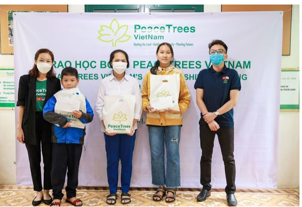
Quảng Trị students received PeaceTrees scholarships in early November