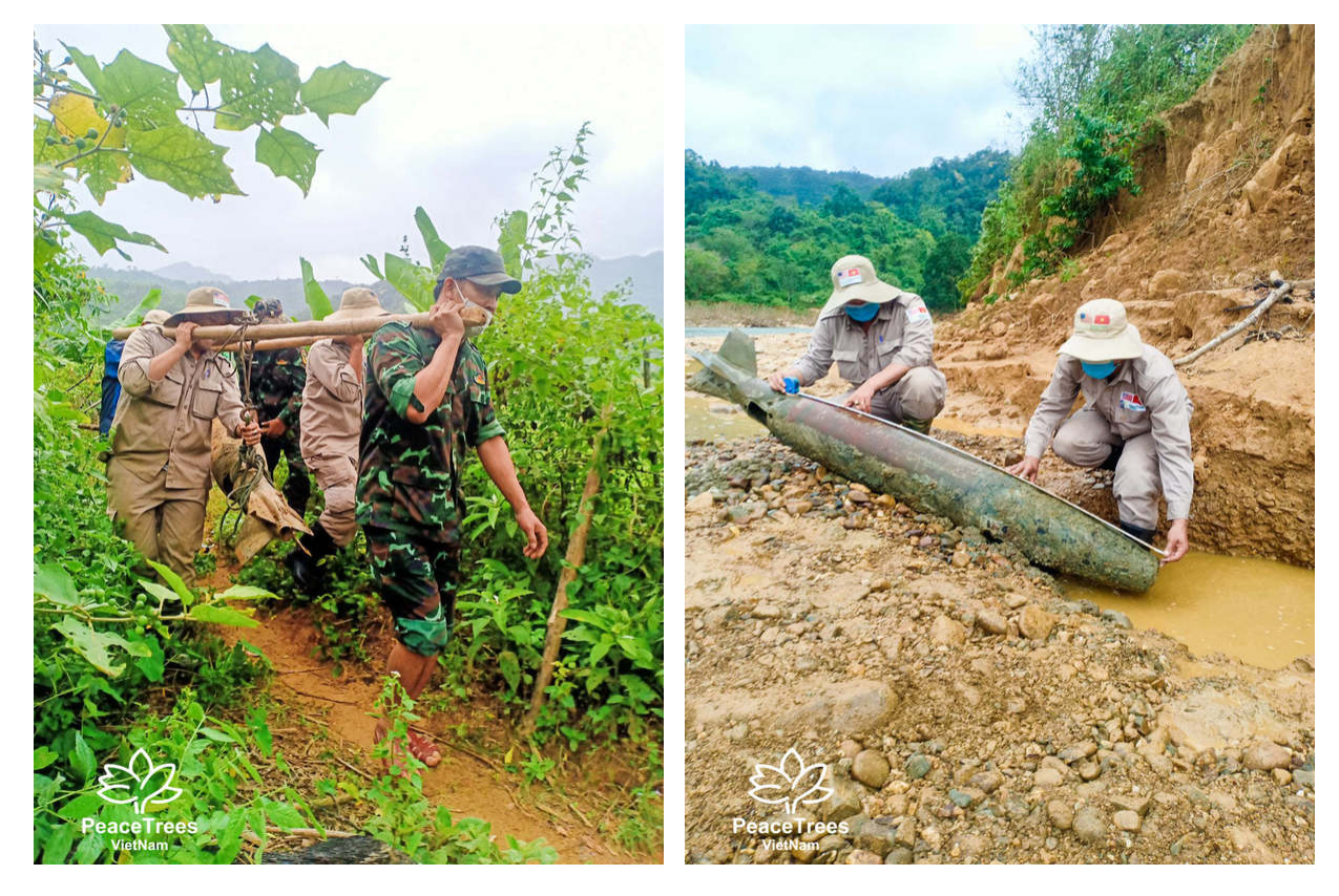
A PeaceTrees EOD team using bamboo poles to transport the heavy bomb

Early November brought heavy rains to central Vietnam, unearthing several dangerous bombs. On November 8th, PeaceTrees teams were notified by the Quang Tri Mine Action Center about two large bombs discovered in Huong Hoa District. PeaceTrees EOD technicians spent five challenging hours removing a 500 lb. bomb and transported it to be safely destroyed. The second bomb, weighing closer to 800 lbs., was deemed too dangerous to move so it was flagged and will be destroyed on site as soon as it is safe to do so.