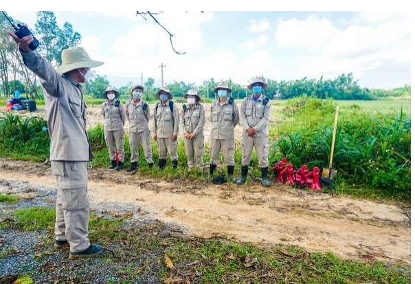
IMAS Level 1 field training