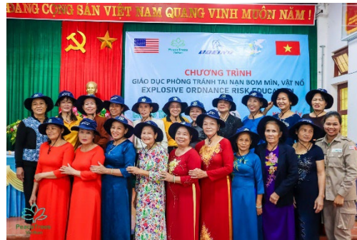
Women's Union at cooperative EORE in Quảng Trị Province