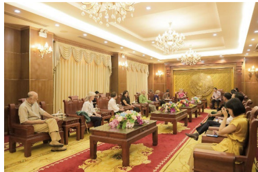
Citizen Diplomats and PeaceTrees in-country staff meeting with the People's Committee of Quảng Trị Province