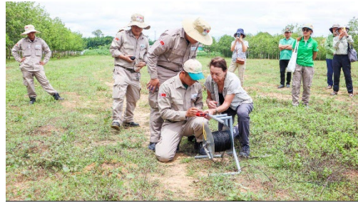
A field visit with PeaceTrees' demining teams in Dong Ha