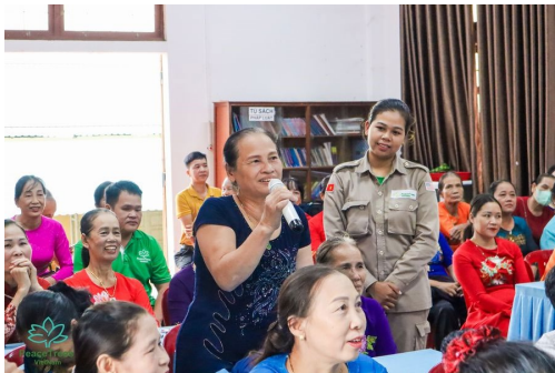
Participants and members of the Quảng Trị Province Women's Union with PeaceTrees EOD technician at the cooperative EORE event

On October 12th, PeaceTrees Vietnam collaborated with the Women's Union of Quảng Trị province for an Explosive Ordnance Risk Education (EORE) event, in honor of Vietnam's own Women's Day. Over 100 members of the Women's Union in Cam Hiếu commune learned about the dangers of explosive ordnance (EO) and what to do if they come across a suspected bomb. EORE events are part of PeaceTrees Vietnam's ongoing efforts to reduce EO accidents in the community. Celebrated on October 20th, Vietnam has its own Women's Day holiday in addition to International Women's Day. We extend warm wishes to all women for a meaningful Vietnamese Women's Day this year.