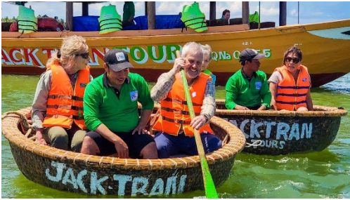
Citizen Diplomats ride traditional boats outside of Hoi An on an all-day eco-tour

visits to cultural sites, and meetings with local officials made this a culturally rich and meaningful journey! If you are interested in joining PeaceTrees on a Citizen Diplomacy trip in 2024, please visit our website .