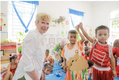
A Citizen Diplomat makes crafts with students at the Cu Ty Kindergarten dedication in Hương Hóa, Quảng Trị Province